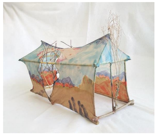
Nicole Donnelly, Barn M, artist-made paper of abaca and flax with pigmented abaca pulp and Mojave Desert inclusions, 8" x 22" x 14", 2017.

of this destructive history into the medium itself. Probably most compelling is the circular work Spotted Lanternfly Red Wing. A concentric ring of the wings surrounds an empty circle on a body of cast abaca and flax paper. Visually compelling, it conveys the deadly impact of these creatures in an environment that cannot resist them.