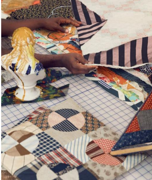
Quilt pieces in progress. “I sit with these quilts for months or years before I can make a single mark. And then it’s led by what the material is going to give back,” he said.