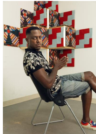
The artist with an untitled work in progress made from heirloom quilts.

It’s his own exhaustion that has caused him to pause the “BAM” series, and he is no longer watching the death videos, for now. “I can’t deal with that today. It’s overload,” he said. “There’s a point where there’s no longer any detachment from these things happening.”