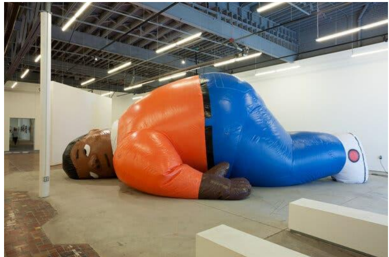
“Laocoön (Fatal Bert),” 2016, based on the Iliad character, depicted in Renaissance sculpture as an icon of suffering, drew criticism for its allusions to police killings of Black men and to the cartoon’s originator, Bill Cosby. Credit...Sanford Biggers

The mandala turned mournful in “Lotus,” a suspended disc of etched glass with an intricate petal pattern, first shown in 2007. Up close, the petals turned out to repeat an 18th-century diagram of a slave ship hold. The image is one of various symbols — the tree, the piano, the clenched fist, the Cheshire-Cat smile — that he carries across formats, including quilts.