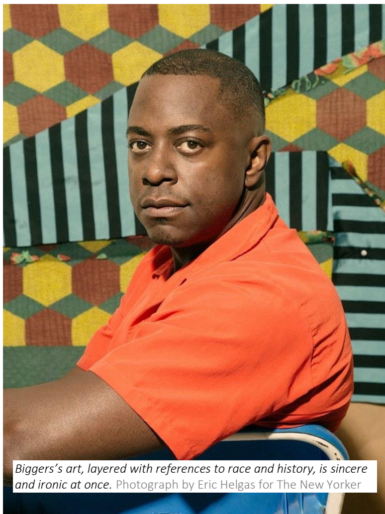
Biggers's art, layered with references to race and history, is sincere and ironic at once.