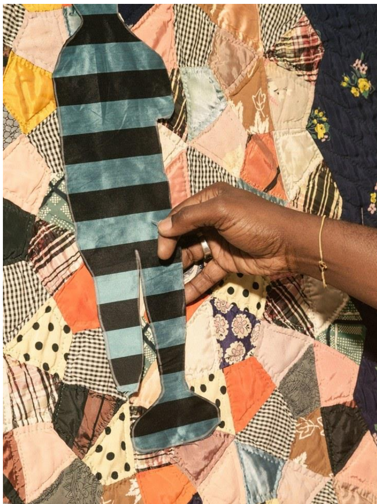
Research on the Underground Railroad, and on the supposed use of quilts as coded signposts, led Biggers to begin painting on them.