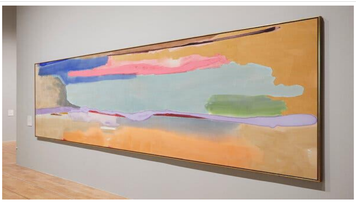
The Whitechapel show opens with "April Mood" (1974) by Helen Frankenthaler.