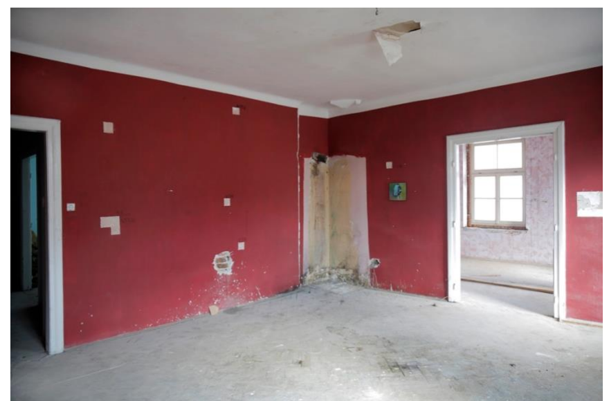
Installation view of Ivan Seal and the Caretaker's "Cukuwruums" at Unsound Festival.

By Andy Battaglia November 14, 2019, 9:30am