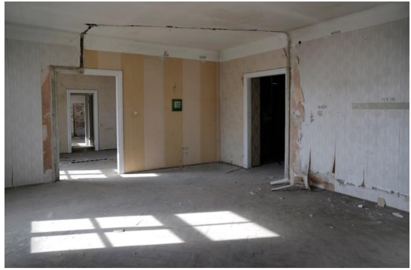
Installation view of Ivan Seal and the Caretaker's "Cukuwruums" at Unsound Festival.

"I didn't want to do a gallery show—I wanted to do something different, in a different space, and this space had cigarette packets with a layer of dust, a bit of either human or animal excretion, an old newspaper from 2014," Seal recalled of rooms also dotted with sheets of exposed insulation and planks of wood that had fallen down. "I said nothing should be cleared up—there would be no brushing up."