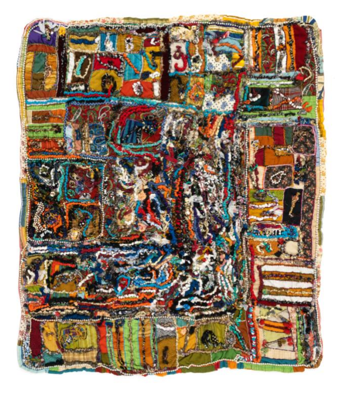
Elizabeth Talford Scott, "Birthday" (1997), fabric, thread, mixed media, 62 x 55 1/2 inches