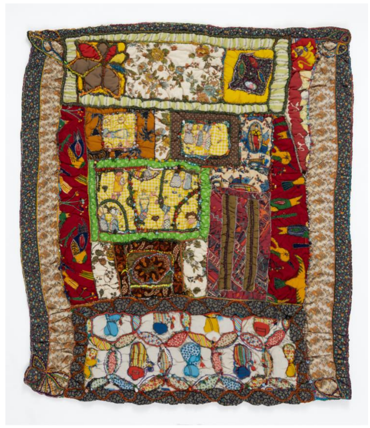
Elizabeth Talford Scott, "Upside Downwards" (1992), fabric, thread, mixed media, 59 x 52 1/2 inches