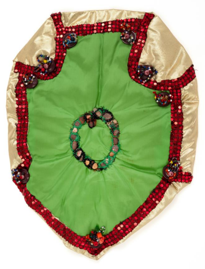
Elizabeth Talford Scott, "Rock Circle 2" (1993), fabric, rocks, buttons, beads, thread, 21.5 x 16 inches