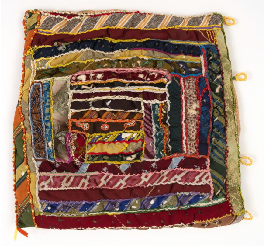
Elizabeth Talford Scott, "Untitled (Lap Cushion)" (circa early 1990s), fabric, beads, buttons, ribbon, thread, repurposed silk and fiber ties, 19 x 20 inches