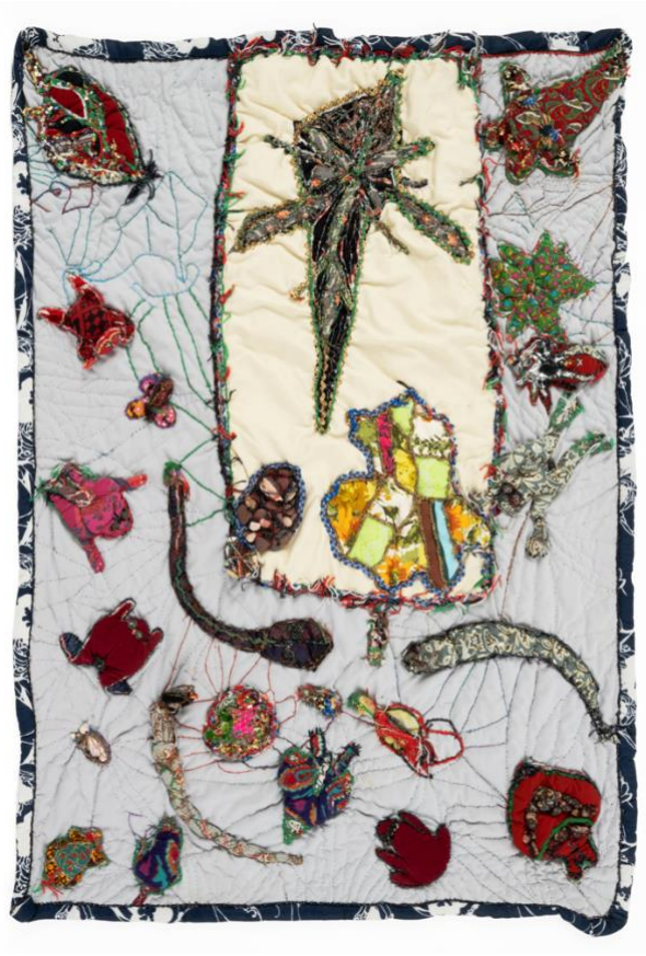
Elizabeth Talford Scott, "Voyage to the Bottom of the Sea" (1992), fabric, rocks, beads, buttons, shells, sequence, ribbon, corduroy, metal, netting, thread, repurposed objects, 69 x 51 inches