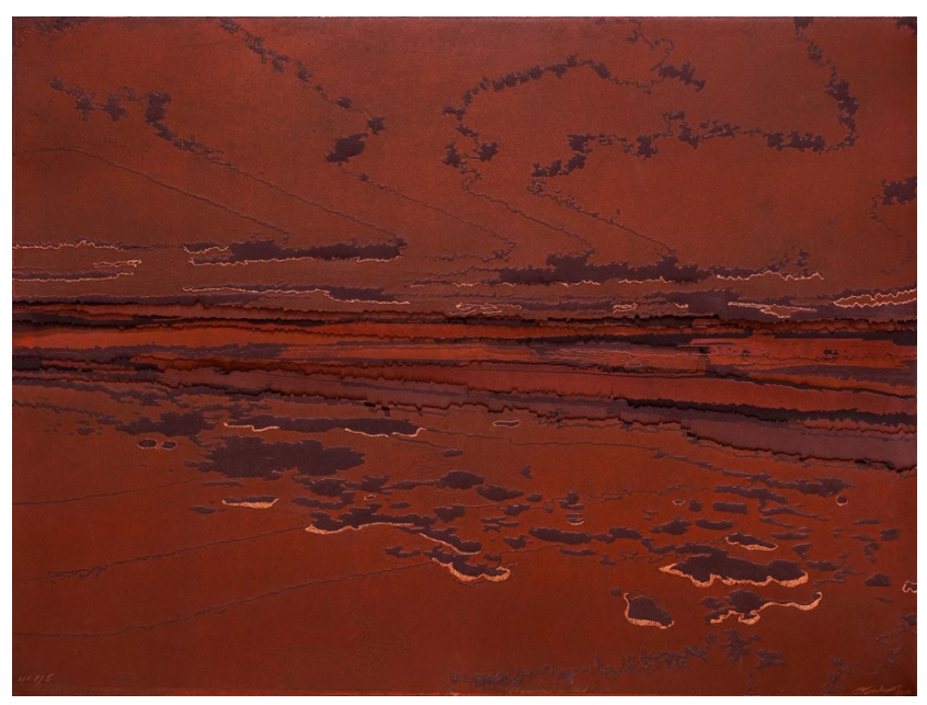
Soledad Salamé, "Atacama in Red," 2017. Printing, laser cutting, embossing, embroidery on 600 gram Fabriano paper. Paper: 30 x 40 in. Frame: 34 x 44 in. Edition 2 of 5.

In Smail's "Virtuoso Fingers", canvas - a woven textile - is shown off with painted and collaged elements sparsely and superbly placed. Loose threads unravel from another strip of partially painted canvas. Collage elements with black and white lines echo thread lines. A pink- and black-painted rectangle creates an asymmetrical balance. Smail creates spaces that are at once teetering and balanced, expansive and intimate.