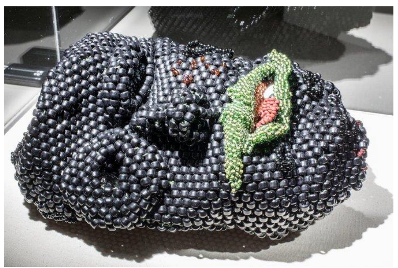
Sculptures addressing racism include "Rodney King's Head Was Squashed Like a Watermelon," from 1991.