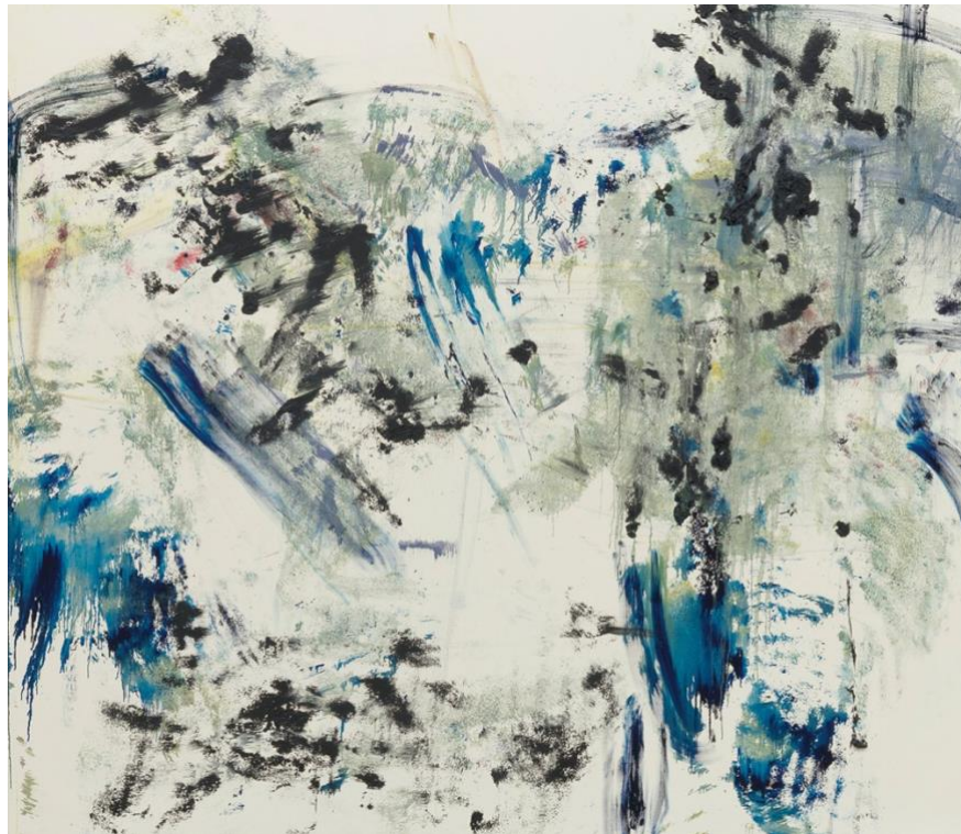
Louise Fishman, Like Air I'll Rise , 2018, oil on linen, 74 x 86".

That was her kind of politics and her kind of love: Start with your own struggle, look to the surrounding world to figure out your community, work out your relational lifelines by means of what you love, maintain an attitude of remembrance but noncompliance.