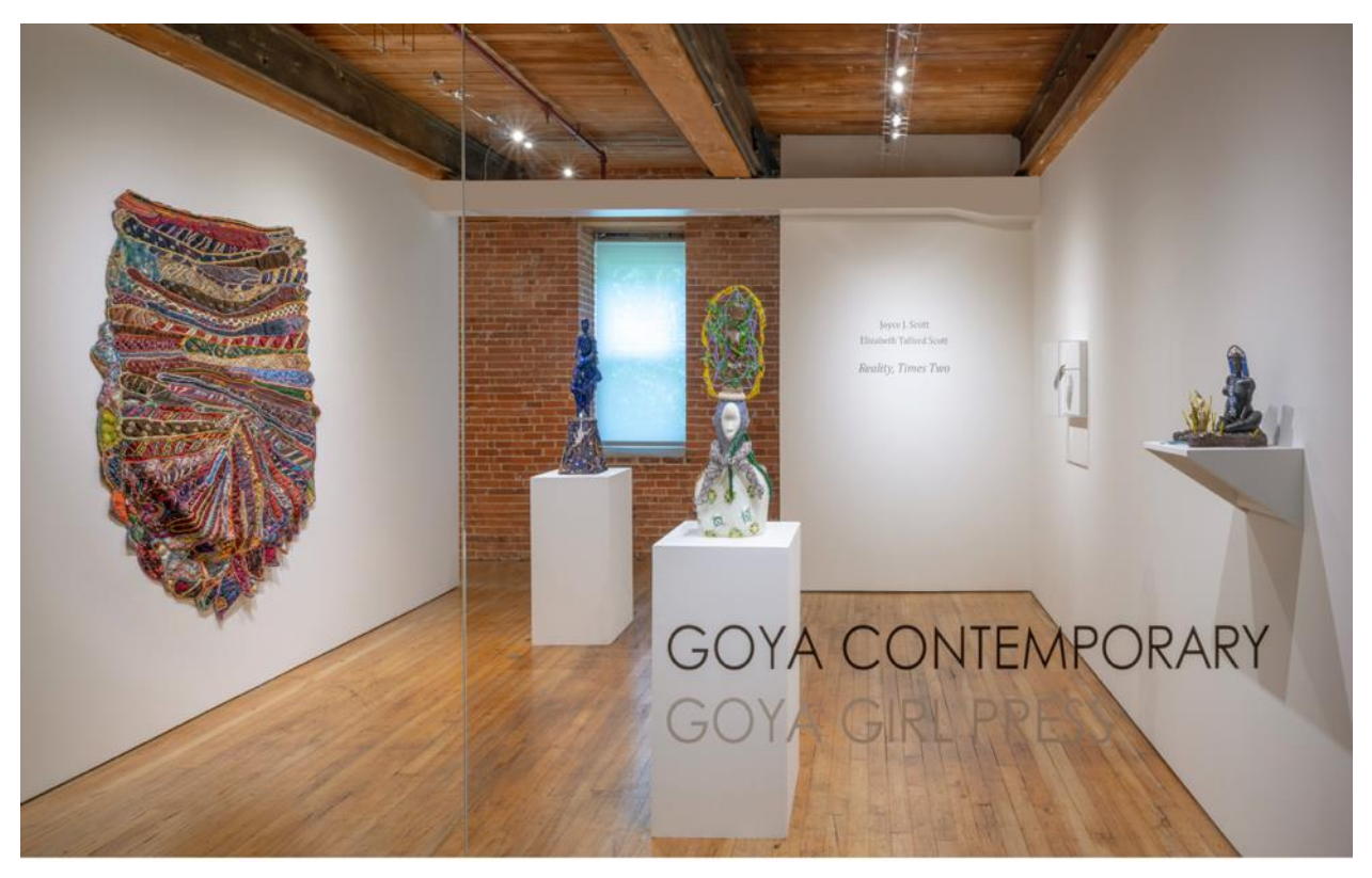
On View presents images from noteworthy exhibitions

by VICTORIA L. VALENTINE on Jul 31, 2019