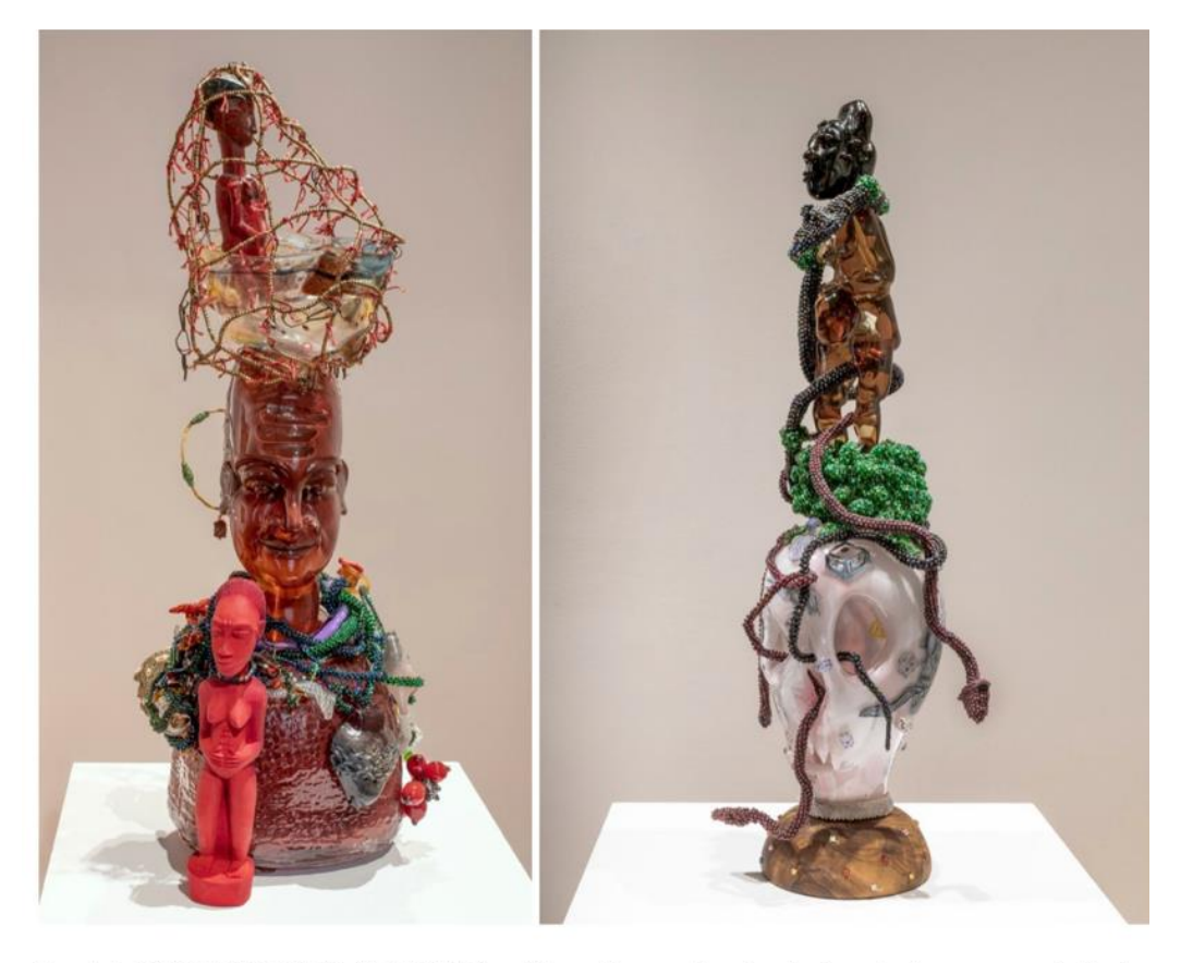
From left, JOYCE J. SCOTT (2), "Ark," 2019 (hand-blown Murano glass, beads, thread, wire, repurposed objects, 31 ½ x 13 ½ x 6 inches); and "War women III," 2014 & 2019 (hand-blown Murano glass, beads, thread, wood, plastic dice, 31 x 9 x 8 inches).