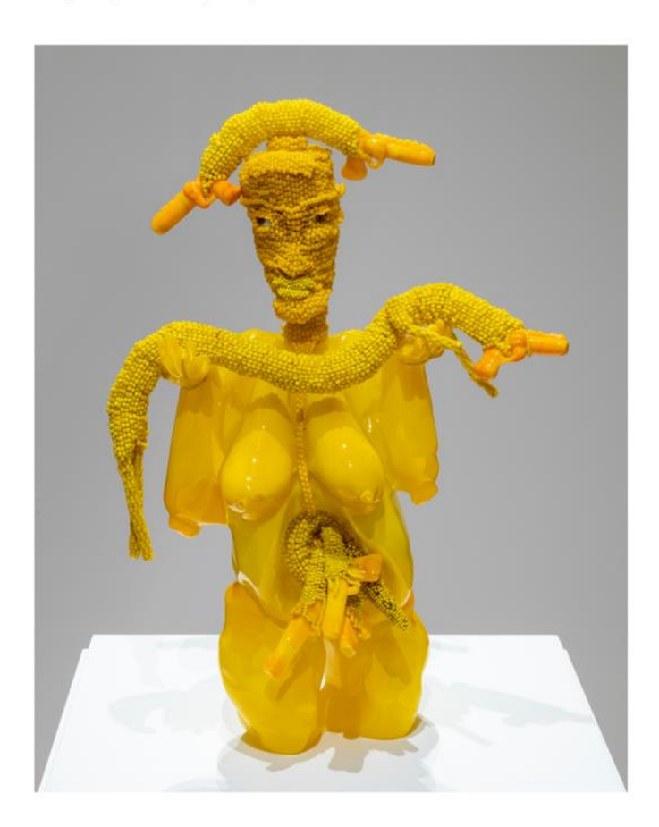
JOYCE J. SCOTT, "Gun Woman," 2019 (hand-blown Murano glass, beads, thread, 19 ½ x 13 ½ x 6 inches).