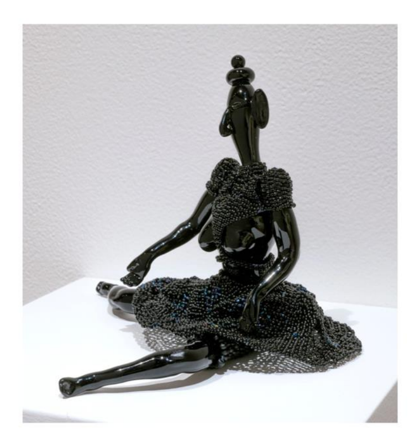
JOYCE J. SCOTT, "Beauty," 2019 (Murano glass, beads, thread, 6 x 8 x 7 inches).