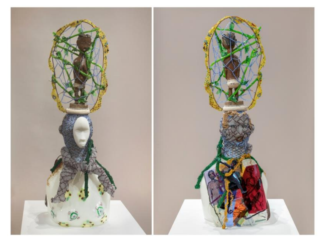
From left, Front and back views of JOYCE J. SCOTT, "Taleteller," 2019 (hand-blown Murano glass, beads, thread, found objects, copper wire, cement, 35 x 11 x 10 inches).