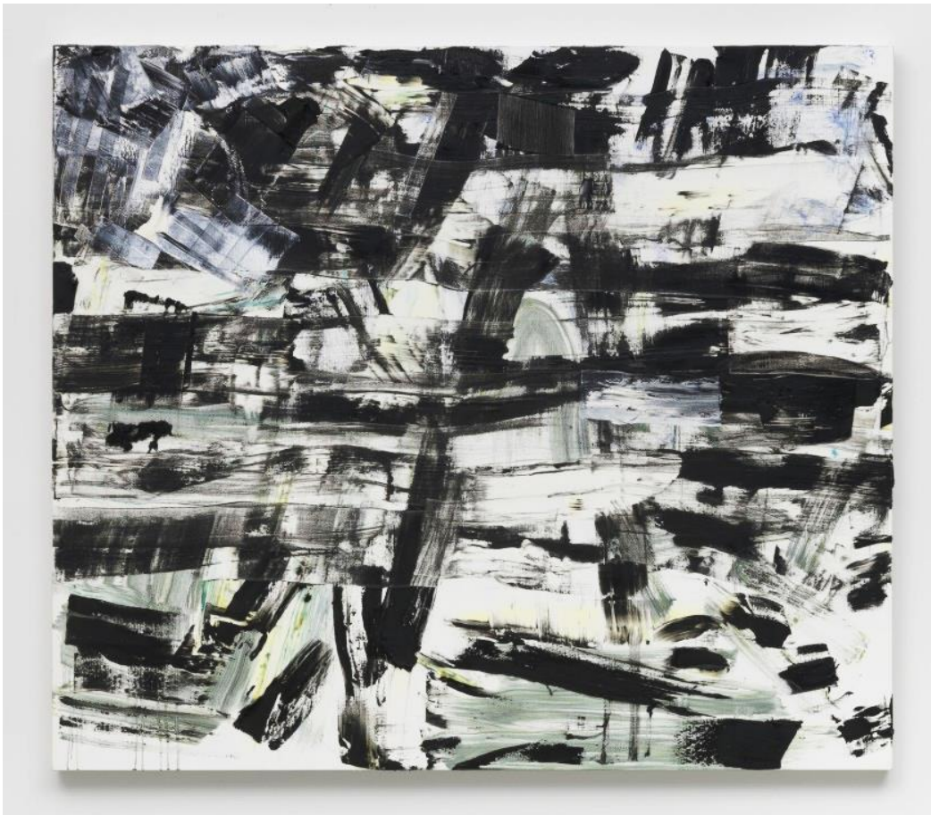
Louise Fishman's "Frigg," 2018. Oil on linen, 74 inches by 86 inches.

Some passages look scraped, leaving a thin layer of paint that sets the weave of the canvas into relief. In other places, delicate white ridges rise where a patterned object has been pressed into the wet paint and lifted. Fishman is sculpting motion and time here in stark, dynamic, immersive terms. "Frigg" has the quality of film, as of a landscape shot from a passing car and blurred by memory.