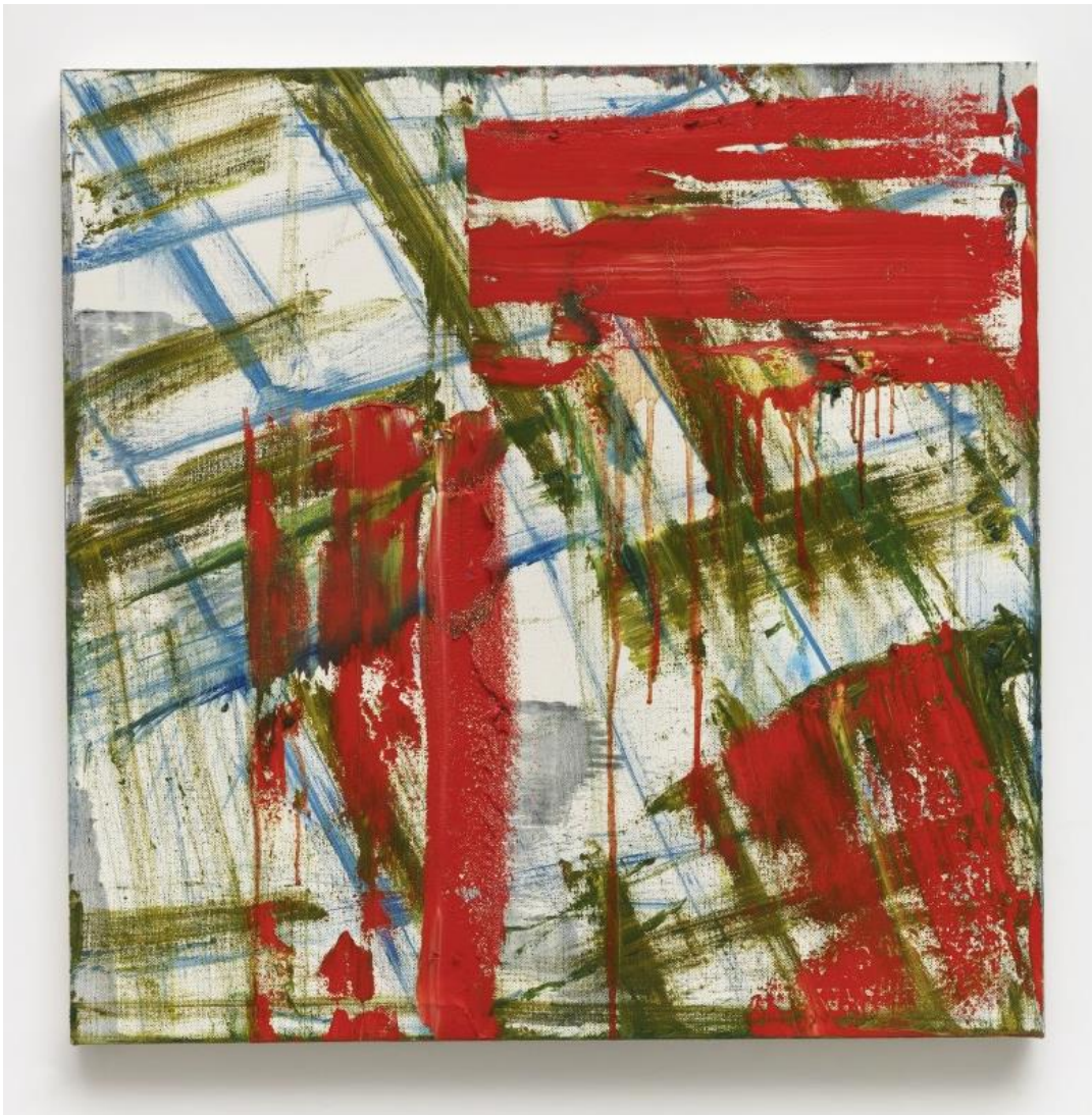
"A Rush of Hard Consonants" by Louise Fishman, 2018. Oil on linen, 30 inches by 30 inches.

Much that is written about painter Louise Fishman begins with biography. The human story never gets old or repeats, but it also can impose a filter that prevents your eyes from seeing and your body from experiencing an artist's work without preconception. Fresh encounter is precious and true. You can learn the back story later, but you can't unlearn it if it's there from the start.