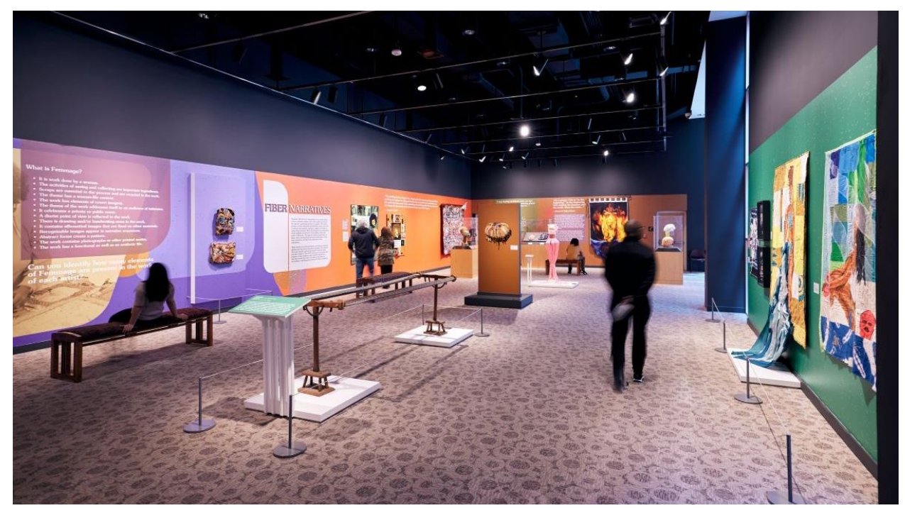
Black Woman Genius.