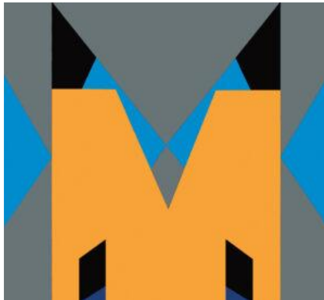
Acrylic No. 2, 2018. Acrylic on canvas, 48 x 52 in. Collection of the artist.