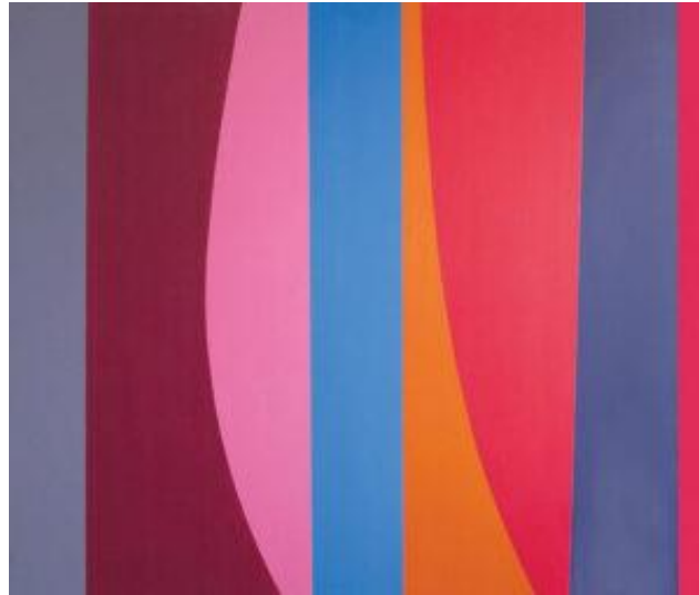
Acrylic No. 4, 1970. Acrylic on canvas, 65 x 79 in. Museo de Antioquia, Medellin, Colombia.

In two works from the past five years, Acrylic No. 2, 2018 and Acrylic No. 1, 2021 , contrasting sensations of star-like explosion and inward reflection are generated. I think of the intersecting, geometric schemes of a charbagh, the organizing principal of Persian and Mughal gardens that is based upon the four gardens of Paradise mentioned in the Quran. As a model for organizing the wild landscape into a cultivated space, this idea could also refer to the alternating forces of effort and freedom required of a painter whose goal is to harness the elements of her discipline in order to offer us any number of paths to paradise.