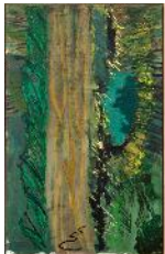
Per Kirkeby (b. 1938 - d. 2018, Danish) Untitled, 2007 Oil on Canvas 64 x 40.5 x 1.5 inches Kirk-1009-O