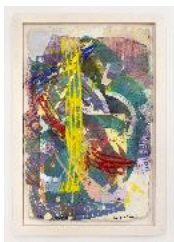
Sam Gilliam (b. 1933, American) Rivulet , 1994 Mixed-media and print on handmade paper Paper size: 38.375 x 25 inches Frame size: 44 x 30 inches Variable edition 2 of 6 Gill-1001-O