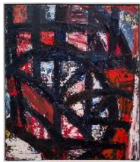
Louise Fishman (b. 1939 - d. 2021, American) I'll Be Seeing You , 1984 Oil on linen Canvas: 47 x 41 inches Frame: 48.5 x 42.5 x 2.5 inches Fish-1042-O