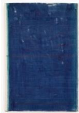
John Zurier (b. 1956, American) Night 49 (Ogata Kenzan) , 2010 Distemper on linen 30 x 20 inches Zurier-0002-O