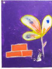
Charles Mason III (b. 1990, American) brick & da flower (It's magic, it's royal, and it's beaten) , 2021 Oil stick, paper, ink, pastel Paper: 50 x 38 inches Frame: 52.5 x 40.75 inches Maso-1033-C