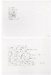
Sonya Clark (b. 1967, American) Lift Ev'ry Voice and Sing , 2021 Diptych: pigment print on piano paper 11.25 x 15 inches each Variable edition 20 of 20 Clar-1046-C