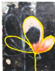
Charles Mason III (b. 1990, American) da radiant, 2021 Oil stick, acrylic, canvas, charcoal, ink Paper: 50 x 38 inches Frame: 52.5 x 40.75 inches Maso-1032-C