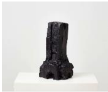
Per Kirkeby (b. 1938 - d. 2018, Danish) Untitled (Lyon), 1987 Bronze 11 x 5.5 x 4.25 inches Edition 6 of 6 Kirk-1012-O