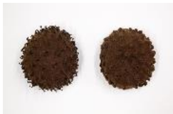
Sonya Clark (b. 1967, American) Skin Pair , 2001 Polyester, felt, thread, wood mount (left) Object #23: 9.75 x 8 x 5 inches (right) Object #24: 9 x 8 x 4 inches Clar-1035-C