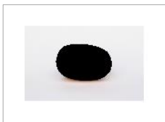
Wilhelm Mundt (b.1959, German) 587-042 , 2020 Light jet print, acrylic, aluminum Dibond 21.625 x 28.75 inches Mund-1015-O