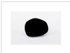
Wilhelm Mundt (b.1959, German) 595-031 , 2016 Light jet print, acrylic, aluminum Dibond 21 x 28 inches Mund-1007-C