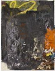
Charles Mason III (b. 1990, American) da gun with the flower (not seen) , 2021 Ink, pastel, acrylic, oil stick, paper Paper: 50 x 38 inches Frame: 52.5 x 40.75 inches Maso-1027-C