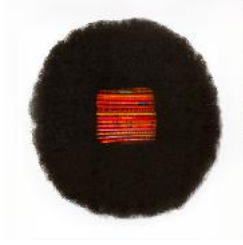
Sonya Clark (b. 1967, American) For Colored Girls, A Rainbow, O1 , 2019 Wig, cast plastic combs, wrapped thread 12 x 12 x 3 inches Clar-1031-C