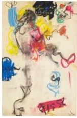
Jack Whitten (b. 1939 - d. 2018, American) Untitled , 1964 Pastel and ink on paper Paper: 19.75 x 12.75 inches Frame: 25.875 x 18.5 inches Whit-1000-C