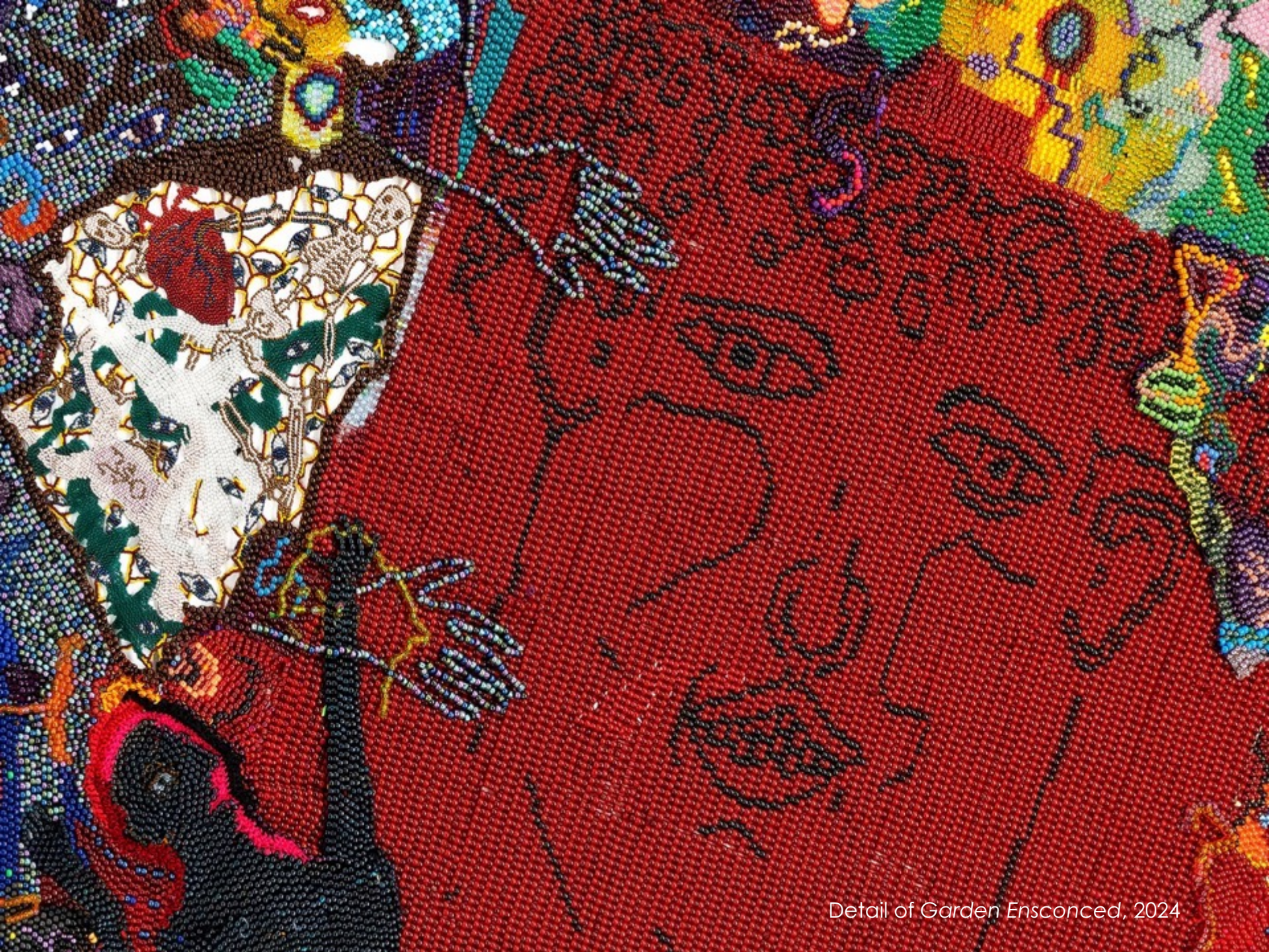
Detail of Garden Enscenced , 2024